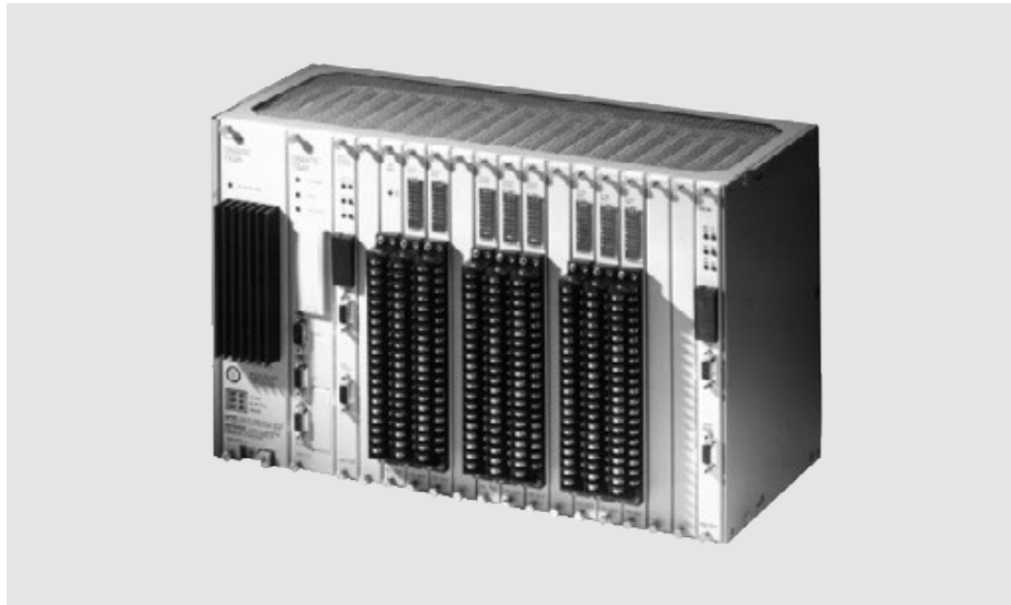
Fig. 5/1 SIMATIC 505 programmable controllers

The SIMATIC 505 programmable controllers provide a special combination of open-loop control tasks, closed-